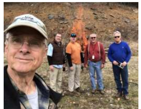
Members mugging for the camera at last year’s work party.